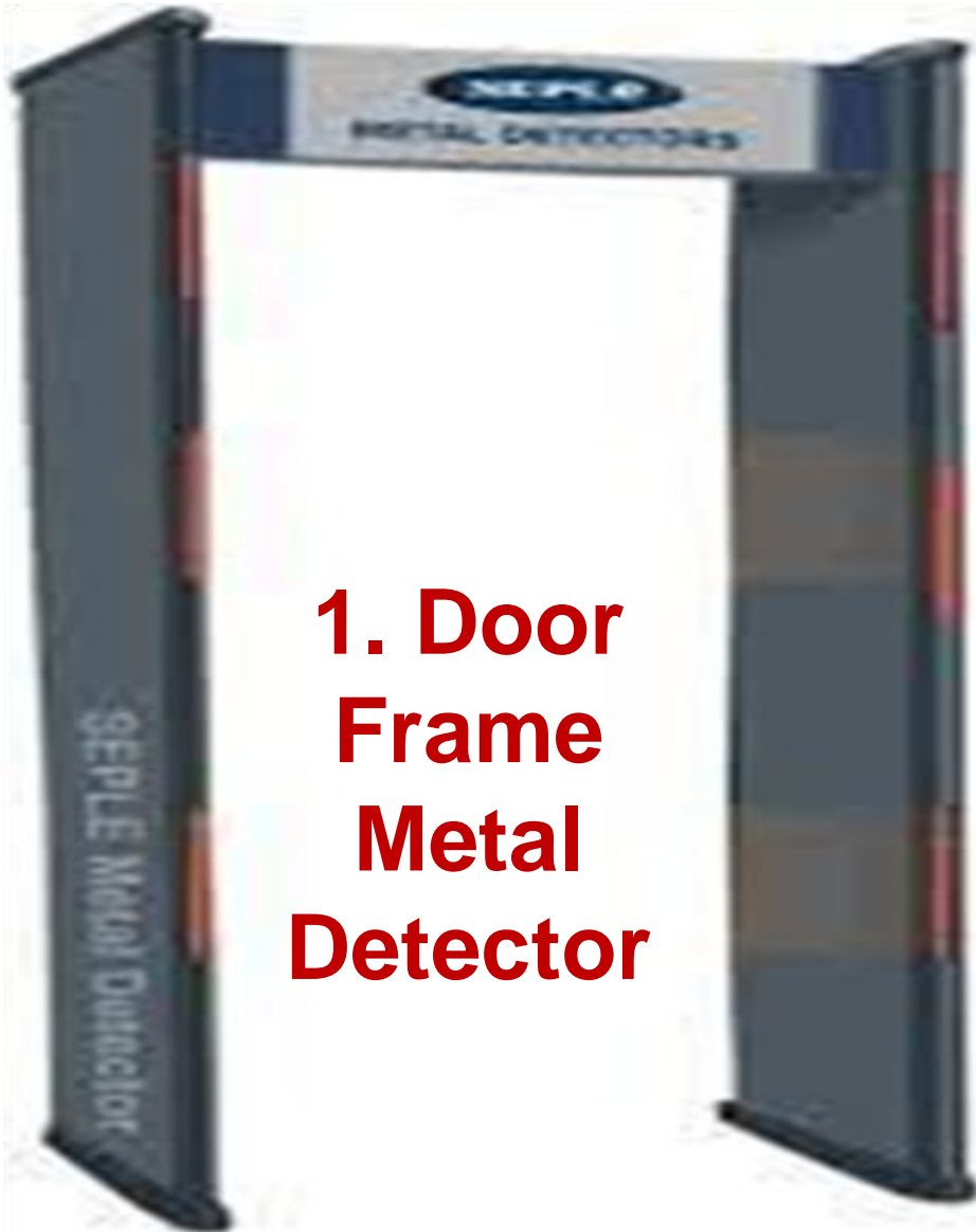
1. Door Frame Metal Detector