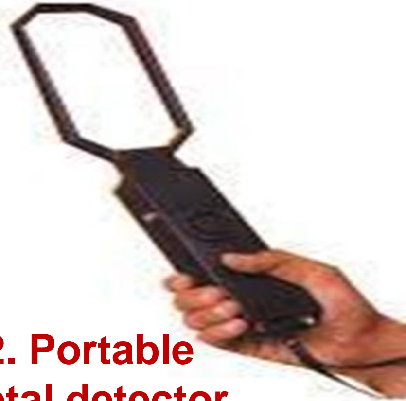
2. Portable Metal detector