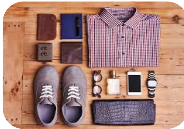
Personal Belongings Safety