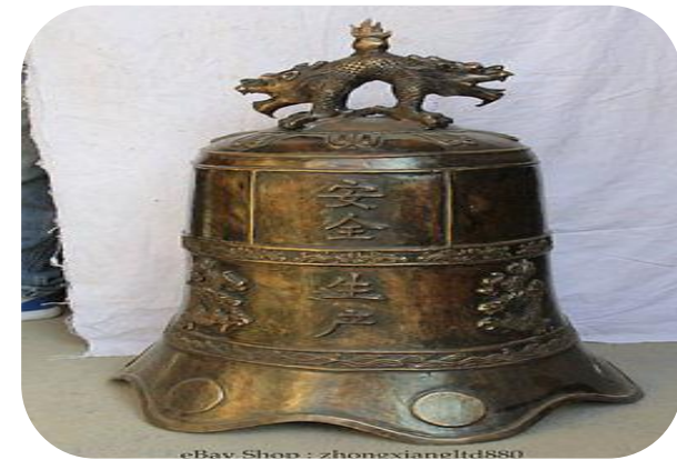
Temple Antiques Safety