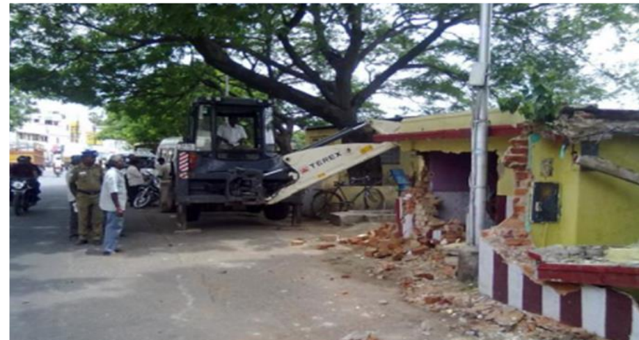
on the road