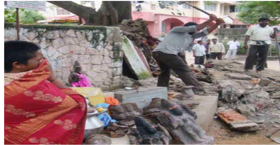
on the FOOTPATH