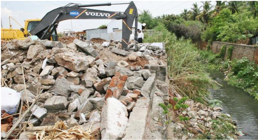
on the canal bank