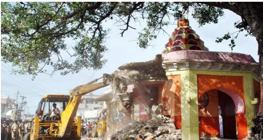
on the road