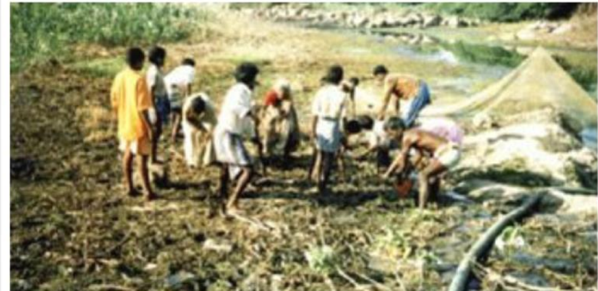
DEWATERING & DESILTING the POND