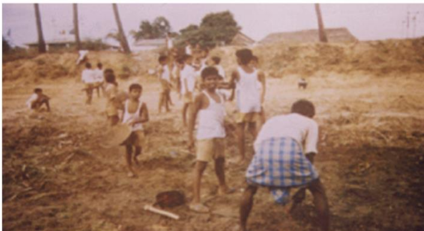
Even school children lend their helping hand