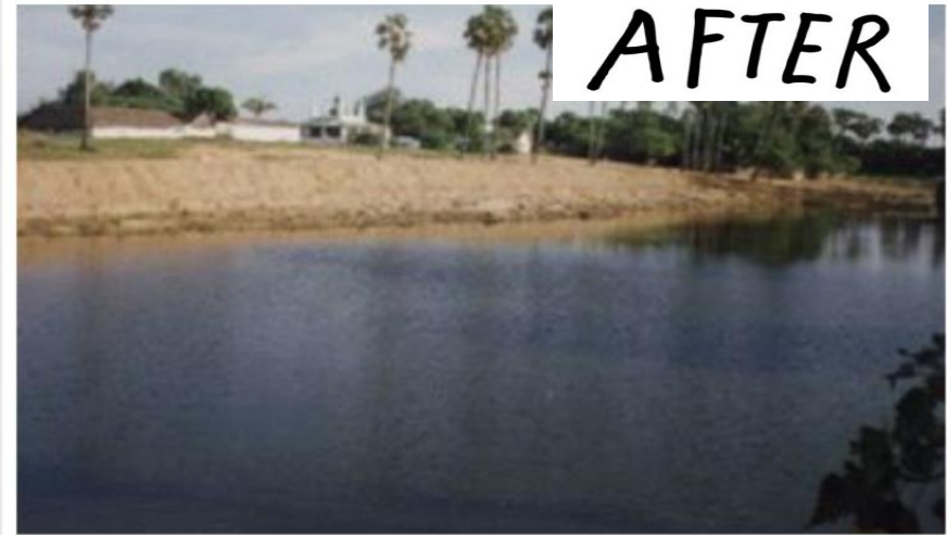
The clean restored Pond