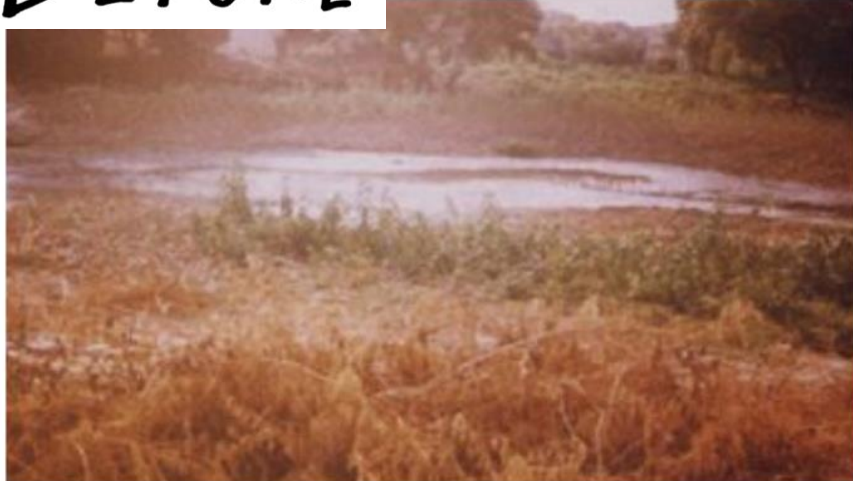
POLLUTED & SILTED POND