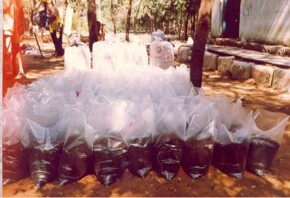
Compost in Bags Ready for Sale