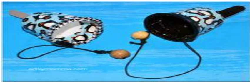
Recycled K Cup Craft & Toy