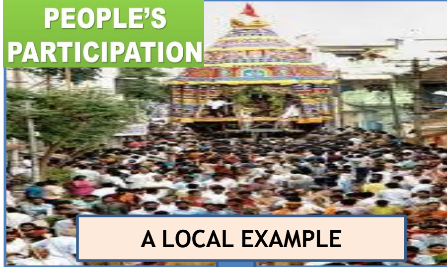
A LOCAL EXAMPLE

People pulling together the mammoth TEMPLE CAR is the best LOCAL EXAMPLE of PEOPLE'S PARTICIPATION