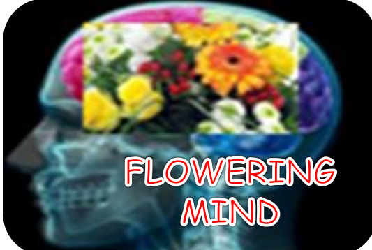
1. YOUR HEAD "FLOWERING MIND" via "I MY SELF" by "I E×NoRa"

Realise MODEL HOME (also your office, school & college), STREET & RESIDENTIAL AREA. What you need is not money but people motivated as SOCIAL CAPITAL? The 5 HABITS that will save 3 Ps, PERSON, PEOPLE & the PLANET