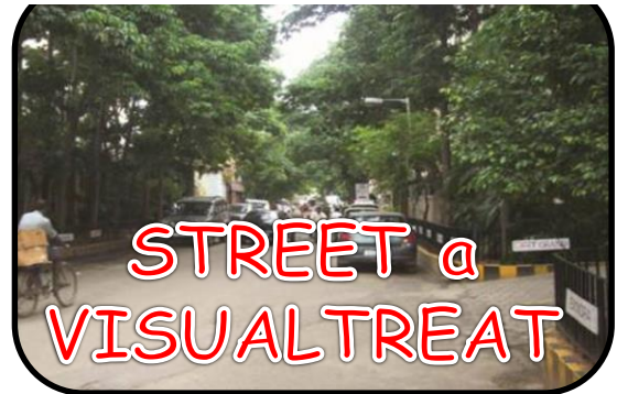
3. YOUR STREET "A VISUAL TREAT" via "ACT LOCALLY" by RWA E×NoRa