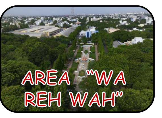
4. YOUR AREA "WA REH WAH" via RENDER COLLECTIVELY by E×NoRa INNOVATORS CLUB