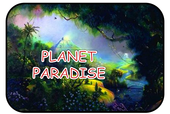
5. YOUR PLANET "PLANT-NET" via "THINK GLOBALLY" before you do anything by ExNoRa INNOVATORS INTERNATIONAL