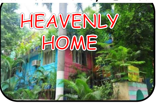
2.YOUR DWELLING "HEAVENLY HOME"** via "DO DOMESTICALLY" ** by HOME E×NoRa