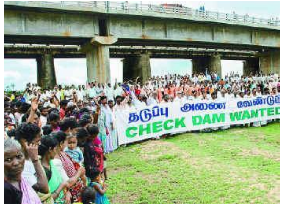
Villagers from Tiruvallur district staging a protest on the Koratalaiyar river bed for construction of a checkdam.

Most of the protesters were agriculturists hit by the drop in the groundwater level and quality. It was difficult for them to raise three crops a year.