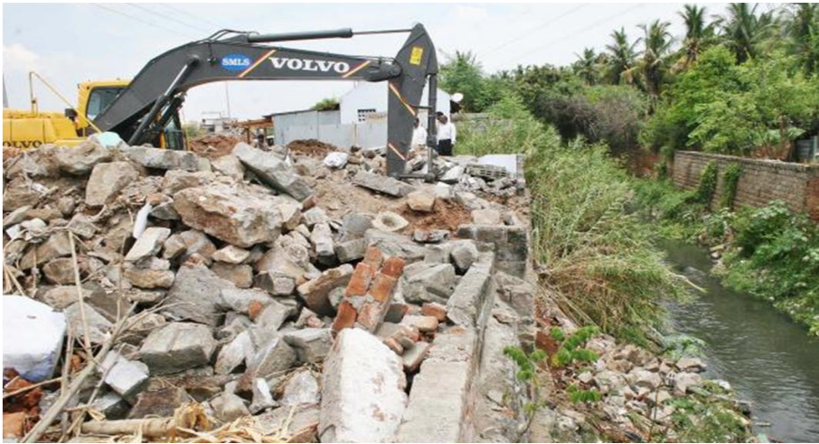
on the canal bank