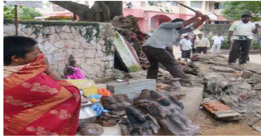
on the FOOTPATH