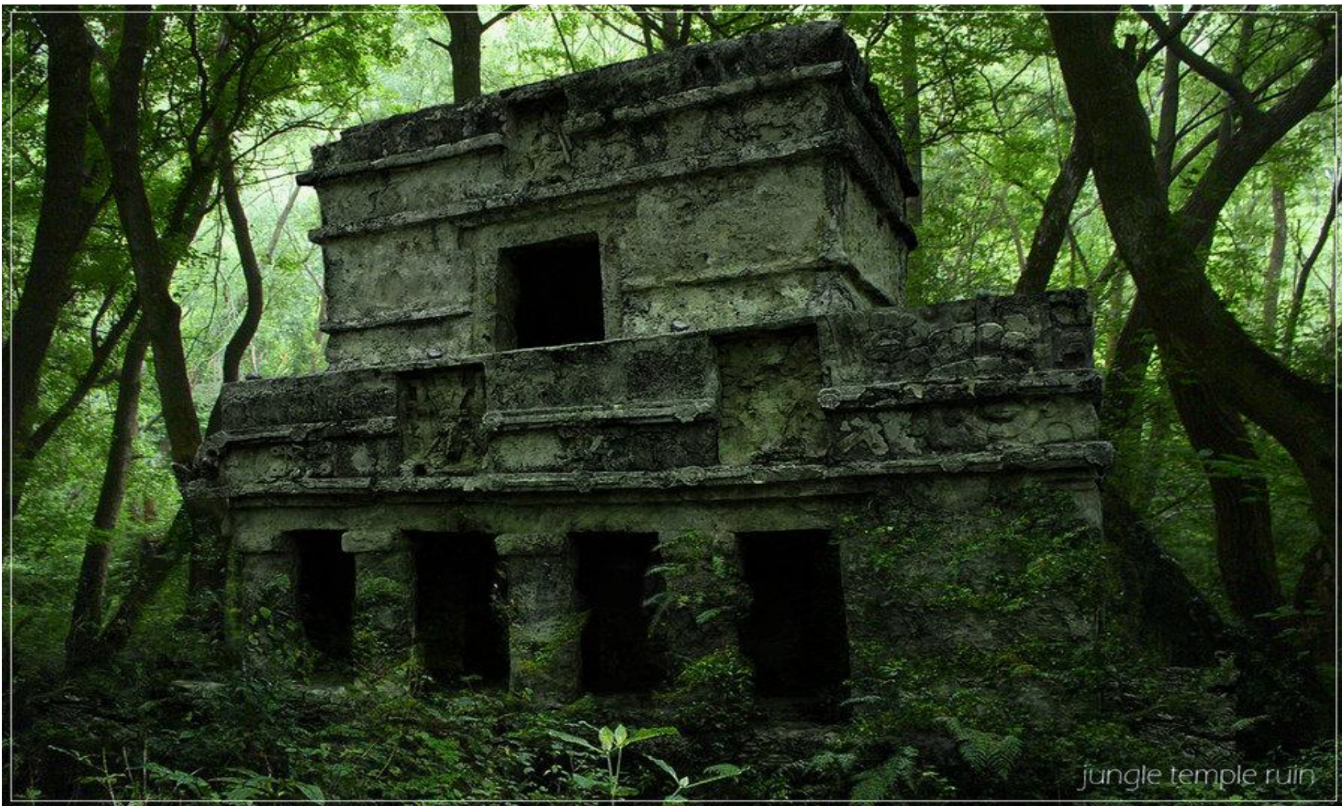
jungle temple ruin