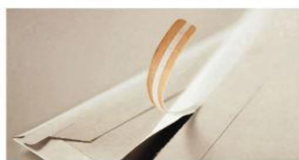
Solutions Express Bag