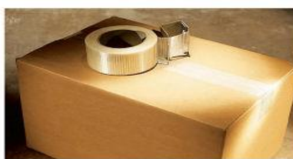
Solutions Carton, Carton Handle