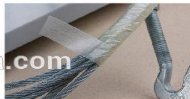
Solutions Steel Rope